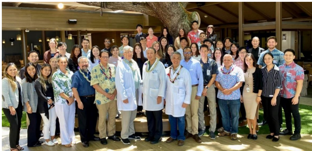
2022 BRITL SIP Faculty and Students